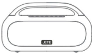
Speaker S8 PRO