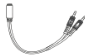
Adapter Cabel Audio 2in1